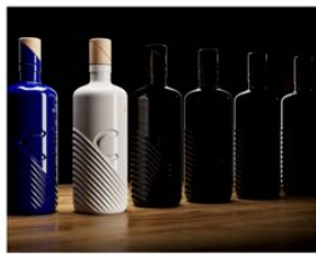
CALLUM Releases its 2nd Single Cask Whisky with Annandale Distillery