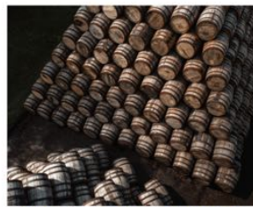
Whisky Partners Unveils New Bonded Warehouse in Alloa, Scotland